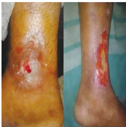
Figure 3 cases of superficial and deep infection

Complication: In our study we came across our fair share of complications. There are 2 (5%) cases of superficial infection and 1 (2.5%) deep infection. There are 2 (5%) cases which went for delayed union. 1 (2.5%) case of non-union where there is no signs of union seen till 9 months of surgery. There were 2 (5%) cases of malunion with 10° varus angulation. No case of ankle instability was present in our study. There were only 5 (12.5%) patients who had restriction below 15° ROM.