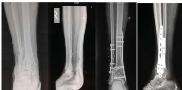
Figure 2 pre and post operative radiograph

Complication: In our study we came across our fair share of complications. There are 2 (5%) cases of superficial infection and 1 (2.5%) deep infection. There are 2 (5%) cases which went for delayed union. 1 (2.5%) case of non-union where there is no signs of union seen till 9 months of surgery. There were 2 (5%) cases of malunion with 10° varus angulation. No case of ankle instability was present in our study. There were only 5 (12.5%) patients who had restriction below 15° ROM.